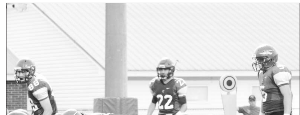
Towns County during a timeout vs George Walton Academy. Photo/Lowell Nicholson

The Towns County defense pitched a shutout in the second half. Photo/Lowell Nicholson